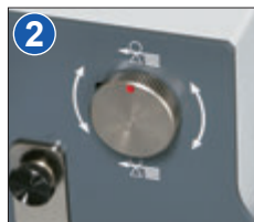
Feed Pressure Adjustment