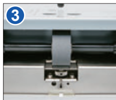
Pad Gap Adjustment