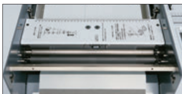
Photo : Fold buckle being removed.

Jammed sheet removal or roller cleaning can be performed easily, without any special tools.